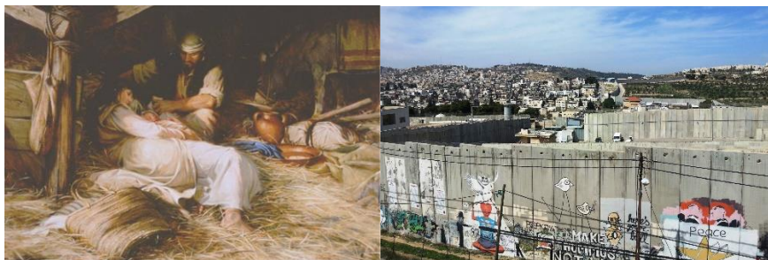
Bethlehem, then and now

The shepherds said to one another, “Let us go to Bethlehem and see this thing that has happened, which the Lord has told us about.” So they hurried off and found Mary and Joseph, and the baby, who was lying in the manger. When they had seen him, they spread the word concerning what had been told them about this child, and all who heard it were amazed at what the shepherds said to them. But Mary treasured up all these things and pondered them in her heart. The shepherds returned, glorifying and praising God for all the things they had heard and seen, which were just as they had been told.