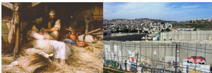
Karl Bloch, The Birth of Jesus (L) and the Bethlehem Wall 2014 (R)