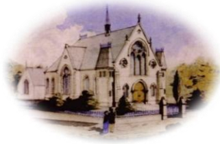
Wesley Chapel 1876

MAY 2026 MAGAZINE: All items for inclusion in the next edition of the Magazine to be sent to Noel D by 14 th April at the latest, but sooner if possible . Issue date: Sunday, April 26 th .