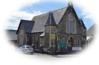
Uniting Church Sketty 2026

Uniting Church Sketty, Dillwyn Road, Sketty, Swansea, SA2 9AH.